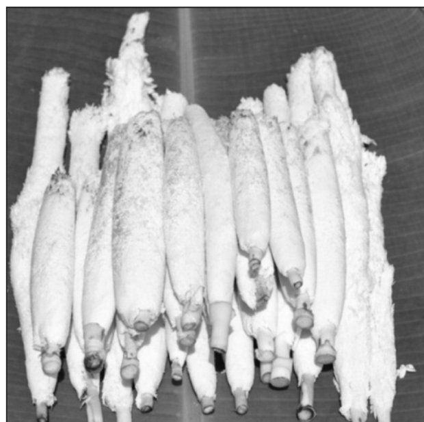
Fig 1. Edible inflorescence of IJ 76-368

The combined cluster analysis of 30 qualitative and 10 quantitative traits showed that most of the accession behaved as independent units with high dissimilarity coefficient. Between two accessions IJ 76-329 and IJ 76-312 more than 75% similarity was observed indicating that these accessions may be a minor variant collected from same locality. The accession 28 NG 82 showed very high dissimilarity with other accessions and remained as a distant node in the dendrogram (Fig. 2) and the remaining accessions were grouped into two distinct major clusters. Similar observations with respect to diversity were recorded by Saraswathi et al. (2013) in the S. edule collection from Papua, Indonesia collected from the population growing from lowland to highland (0-175 MSL). The cluster analysis done by them based on morphological traits showed two distinct clusters from