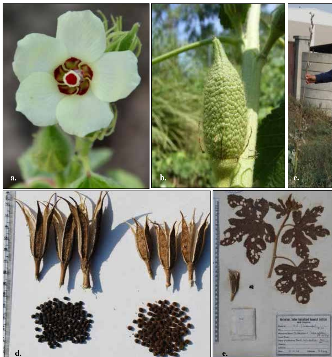
Fig. 1. Abelmoschus tuberculatus var. tuberculatus : a. flower showing unique blotches inside the petal base; b. tuberculated pericarp of immature fruit; c. plant growing in the newly reported location (village Sewah, district Panipat, Haryana); d. mature capsules and seeds (left-var. tuberculatus from collection site; right-var. deltoideifolius from Rajasthan; e. herbarium raised from seeds of accession IW130 (HS5277; 15/12/1946, HB Singh)

Distribution reported (now): details of the distribution site of collected germplasm are as follows: collector no. ANV/18-1143, village Sewah (latitude: 29°36' N; longitude: 76°99' E; altitude: 235 m), Panipat district, Haryana, India; Date of collection: November 19, 2018; flowering and fruiting in October-November.